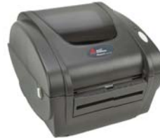
Monarch® 9416™ Desktop Printer

While the Monarch 9416 is small in size, it's big on memory! More memory means faster printing and increased efficiency. The Monarch 9416 printer is a sure way to improve shelf labeling productivity, pricing accuracy and flexibility.