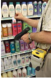
Monarch® Sierra Sport2™ Portable Printer

Small and sturdy, this little printer stands up to your most labor-intensive labeling activities. Designed for speed and label clarity, The Sierra Sport2 reduces process time and ensures pricing accuracy.