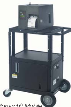
Monarch® Mobile Work Station with Monarch® 9855™ Tabletop Printer

Enjoy the flexibility of printing replacement tags at the product, in the back room or at the POS with this mobile tabletop printing solution from Avery Dennison. No more hand writing or waiting for replacement tags from a third party.. Simply push the mobile work station