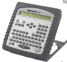
Monarch® 939i® Keyboard

Inline Verifier. Gives you peace-of-mind performance with the ability to back feed and overprint bad tags or labels to ensure unscannable tags and labels will not be used. Tags and labels can be verified at the top printer speed, so productivity is high. This verifier is an option for the Monarch 9864 printer.