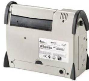
Easy to install battery

What else would you expect from the world's first Hybrid printer? Plug it in, use it with a wall socket. While you are using